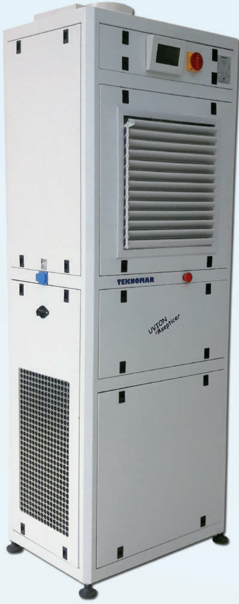
CW650 IO ASEPTICIZER DEVICE FOR ISOLATION ROOMS, INTENSIVE CARE UNITS, OPERATION ROOMS