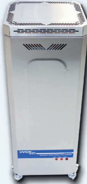
X-RETON P UVION MOBILE AIR STERILIZATION DEVICE FOR PATIENT ROOMS, CLINICS, WAITING ROOMS, ETC...