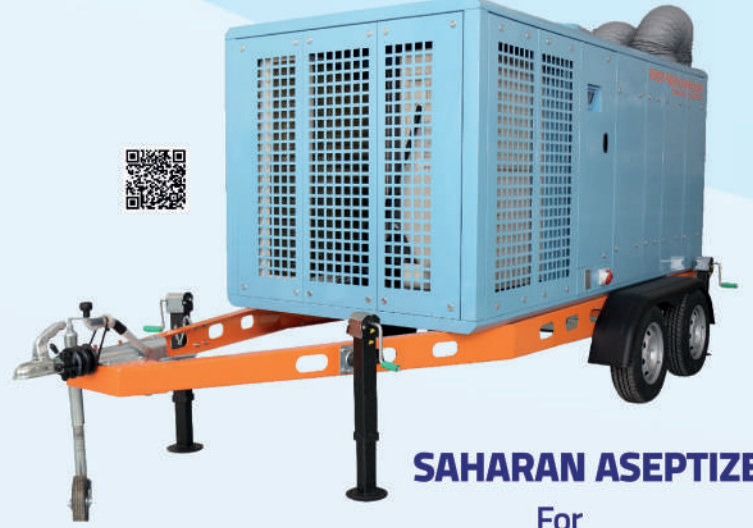
SAHARAN ASEPTIZER For Field Hospitals Tent Type Field Hospitals Hospitals for Disaster Area Container Type Field Hospitals Shed Type Hospitals etc.